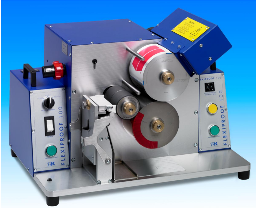
The FlexiProof 100 UV

The RK FlexiProof 100 offers a high speed, operator-friendly machine for the production of proofs using water, solvent or UV Flexographic inks. It is an essential tool for all those involved in the manufacture and use of flexo inks. Ideal for quality control testing to ensure consistency of performance of inks and substrates over time, presentation samples, printability of substrates, R&D including product and commercial viability, and computer colour matching data.