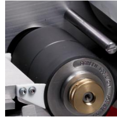
Ceramic anilox – multiple bands