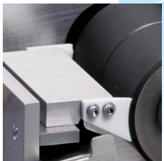
Doctor blade forms ink chamber