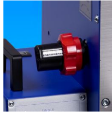
Digital pressure setting, 4µm steps