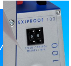
Digital speed control 20 – 99m/min