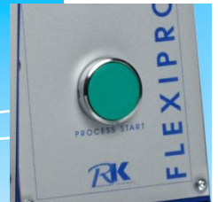
Dual start buttons for safety