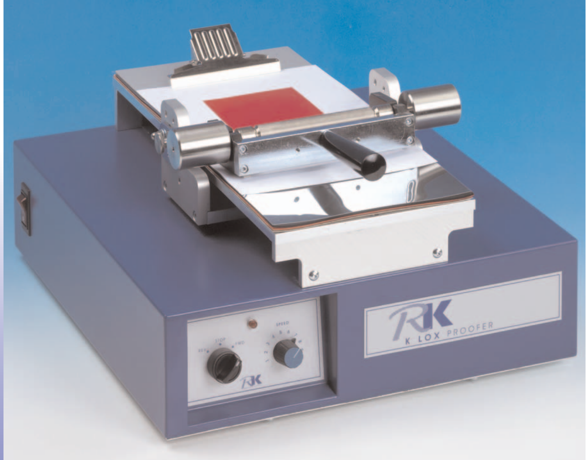
Above: The Automatic K Lox Below: The Hand K Lox.