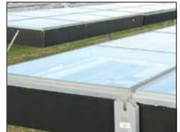
Under glass black box exposure systems, used for automotive interior materials.

Same components as above, plus aluminum black box.