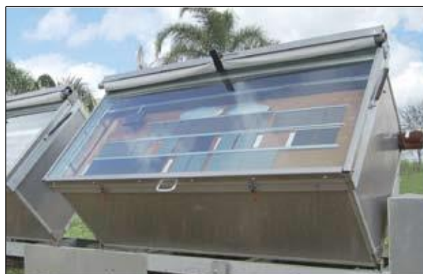
Q-Lab Weathering Research Service offers both typical direct exposure testing and special services. Shown above are AIM (automotive interior materials) boxes, designed to simulate the environment inside an automobile.

Weather conditions at Q-Lab Florida are ideal for automotive testing. Climate data is monitored with state-of-the-art equipment such as Total Ultraviolet Radiometers (shown below).