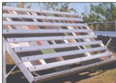
Expand the Q-Rack's capacity by using smaller panels and more panel flaps.

*Available for shipment outside North America