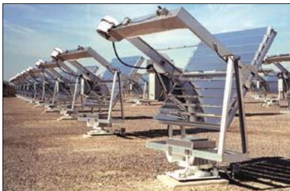
Q-Trac Natural Sunlight Concentrators at Q-Lab Arizona provide accelerated natural weathering results.