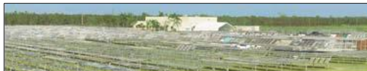
Q-Lab Florida's site near Miami offers subtropical exposures. Q-Lab Arizona's site near Phoenix offers desert exposures.