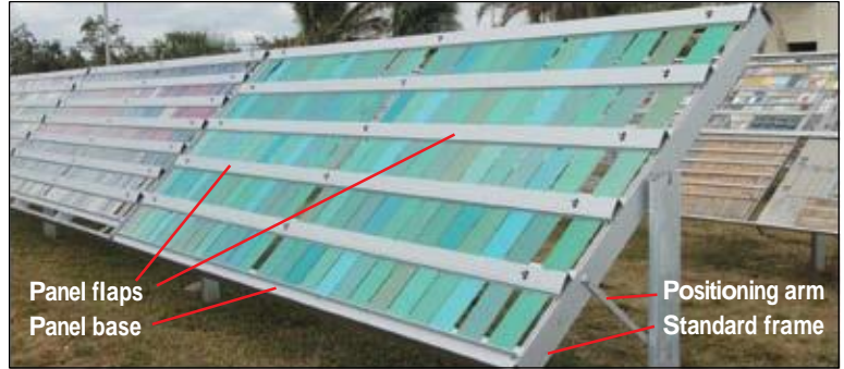
The direct exposure rack is shown here. Panel flap assemblies may be adjusted or added to accommodate different sizes and increase the rack's capacity.